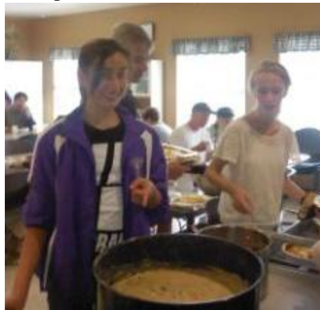
Helping out at Drexel House June 20