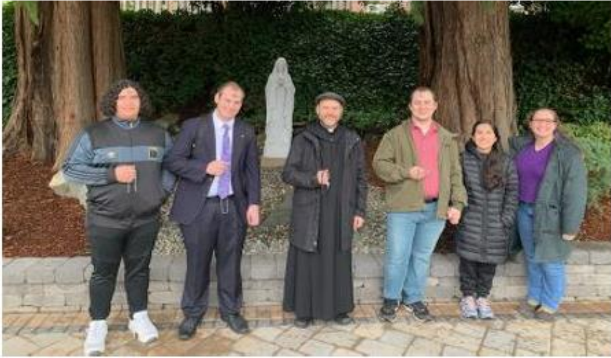
Members of Council 16361 at St. Martin University celebrate the completion of the Marian Shrine;