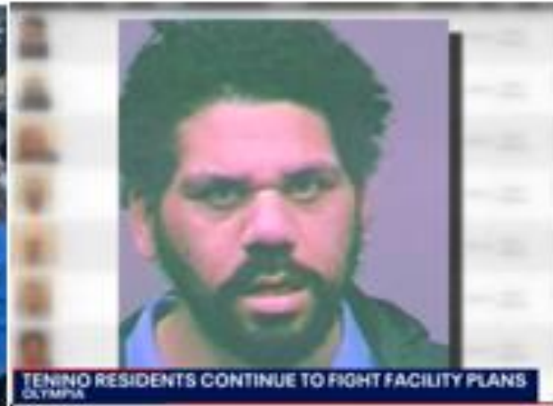
TENINO RESIDENTS CONTINUE TO FIGHT FACILITY PLANS OLYMPIA