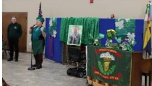
Serving area and singing of Irish Ballads