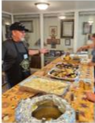
Serving Area with Low County Boil Clam and Cole Slaw

Was attended by 50 families and clergy including Holy Theophany Monastery