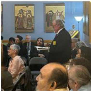
Rosary before Funeral Mass

The funeral services (Great Parastas) will be held on Tuesday, Oct 22, at 6:30 p.m. at St George. The Knights of Columbus will lead the Holy Rosary at St George starting at 6:10 p.m. prior to the services.