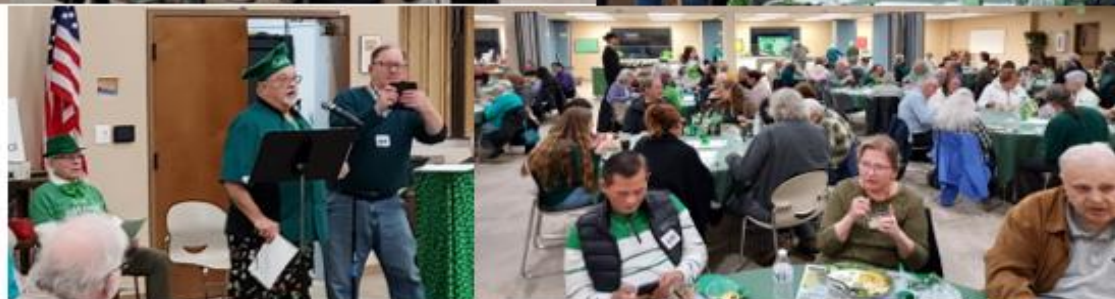
Serving area and singing of Irish Ballads