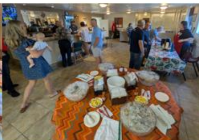
Raw Oysters and