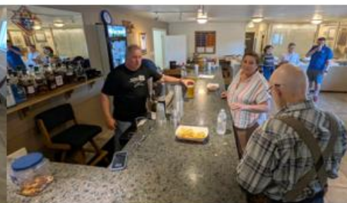
Serving Area with Low County Boiled Clams and Cole Slaw and Drinks

The 2025 Clam Bake was held on Thursday, 21 August at Columbian Hall. We had Low Country Boil, Oysters, Clam Chowder, and Coleslaw.